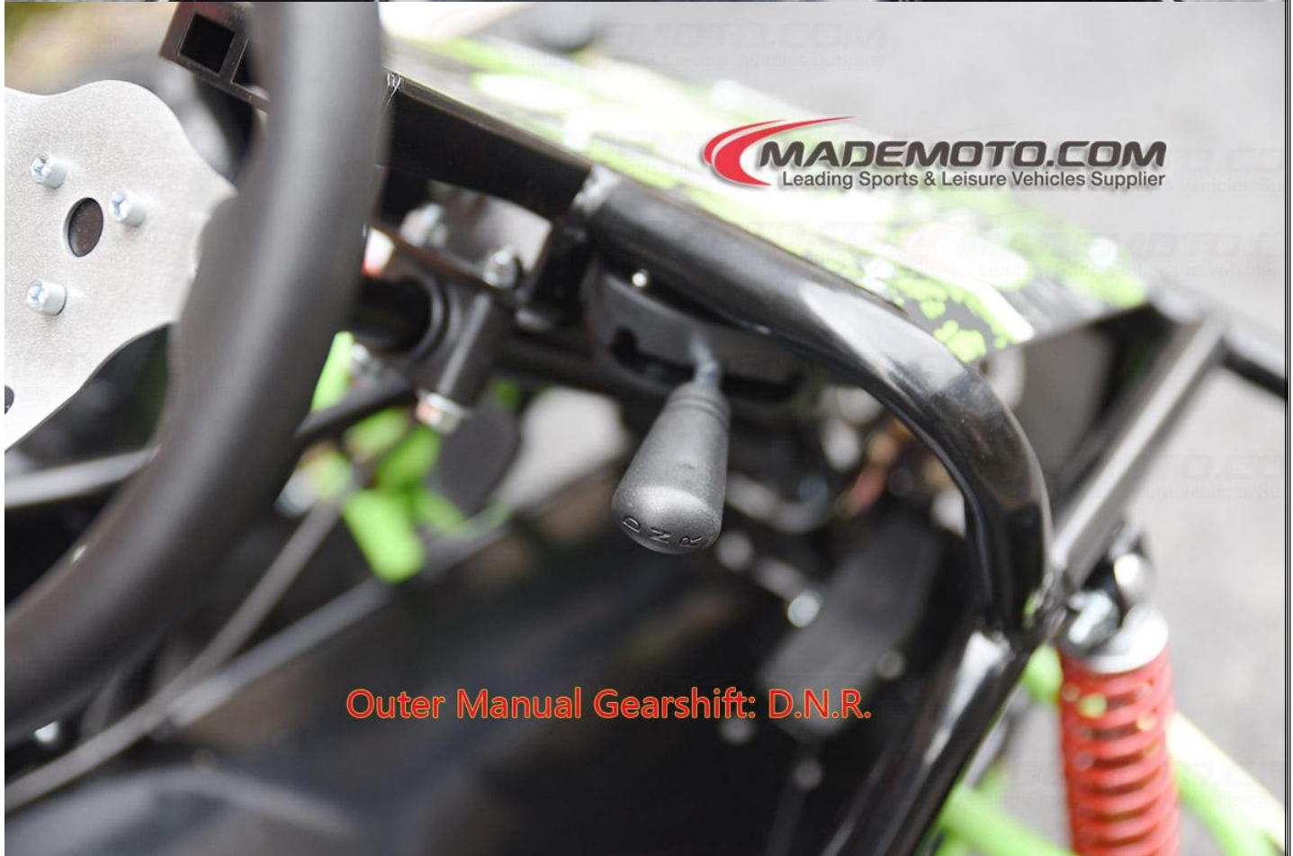
Outer Manual Gearshift: D.N.R.